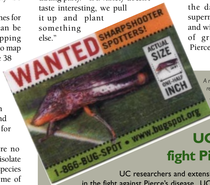
A refrigerator magnet urges Napa County residents to report any sightings of the glassy-winged sharpshooter.