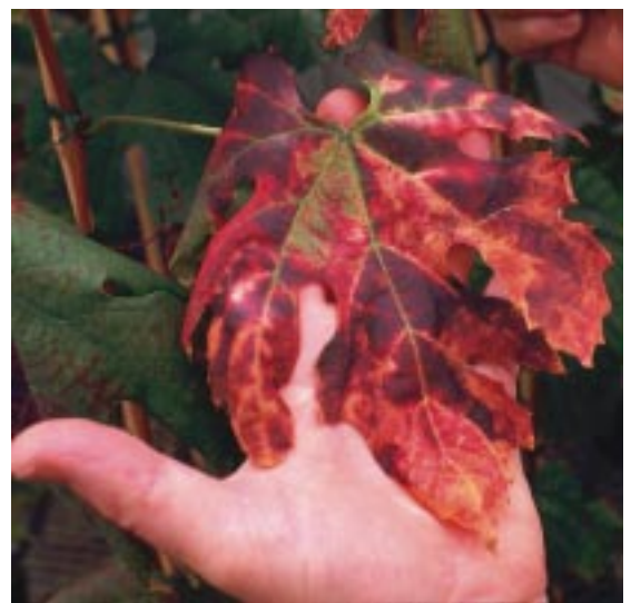
The vivid but unhealthy coloration in this grape leaf is caused by the bacteria Xylella fastidiosa .

Virtually all of the wine grape varieties are a single species, Vitis vinifera . Originally from central Asia, vinifera varieties are susceptible to Pierce's disease. On the other hand, American species including V. shuttleworthii ,