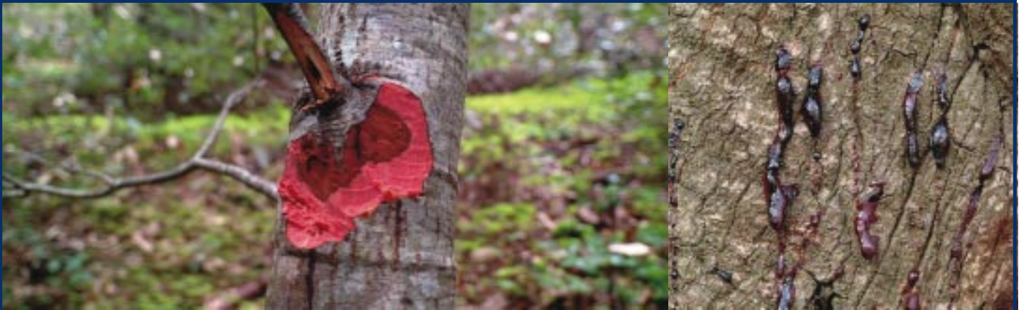
Two views of sudden oak death. On the left, a canker on a Tanoak caused by infection with Phytophthora ramorum , the fungus-like pathogen that causes sudden oak death. On the right, an oak tree with the same disease, showing the discolored sap that is characteristic of the disease in oaks.

For thousands of years, California's oak trees have thrived, and the lives of the oaks have grown intertwined with the lives and identities of the people of the state. Their acorns fed Native Americans and later the oaks lent their name to emerging towns and cities – Oakland, Thousand Oaks, Oak Grove. John Steinbeck's second novel, To a God Unknown , tells the story of an ancient California oak and the ensuing human tragedy that follows from its death.